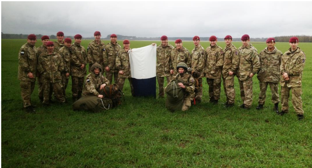
The RQ's final jump