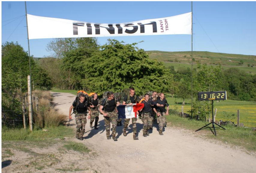
French Signals Compete in the Lanyard Trophy following Ex PEGASUS